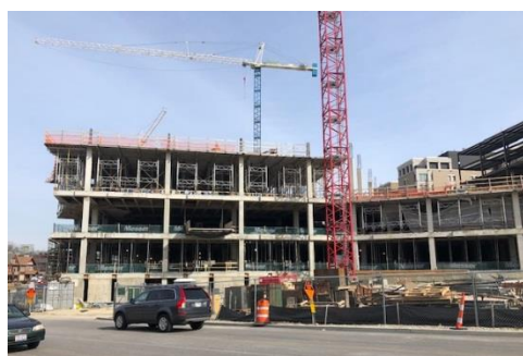
View from Erkenbrecher Avenue, facing east