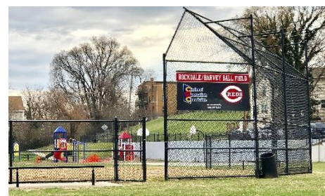
Harvey Park, site of Block Party on May 18